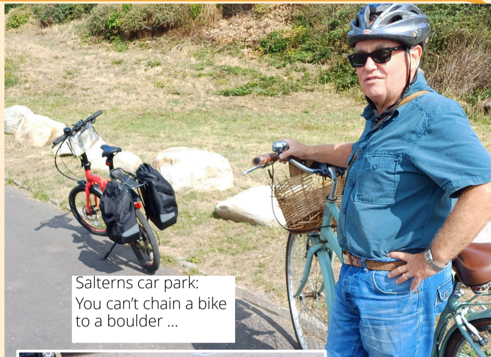
Salterns car park: You can't chain a bike to a boulder ...

* Sign up to our online eFocus (details overleaf) for news of campaigning to win back Hill Head's Blue Flag.