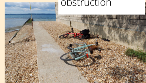
Result: Bikes are often left in places where they cause a nuisance or obstruction

Parking charges should be used to fund improvements, not just as a cash cow