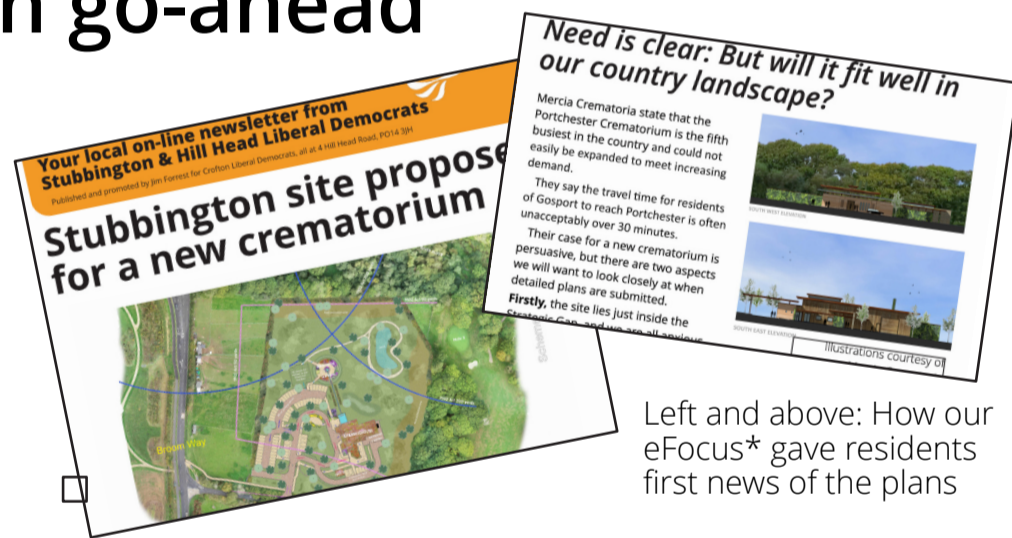
Left and above: How our eFocus* gave residents first news of the plans

"The site is on the edge of the Strategic Gap, but its landscaping will enhance views."