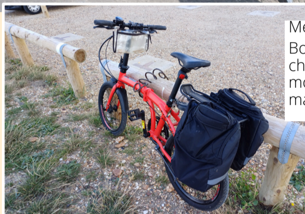
Meon Shore: Bollards will take a chain, but not the more secure D-lock many cyclists prefer